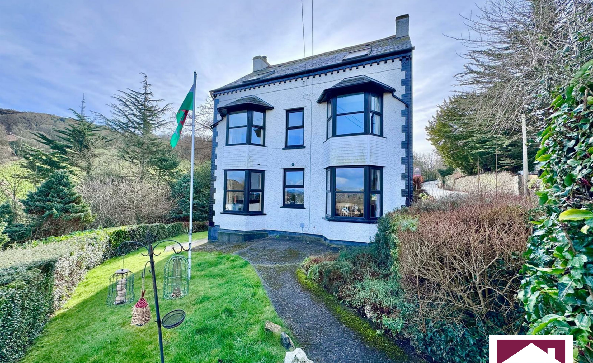
Bod Hyfryd Llanrwst Road Conwy LL32 8HP